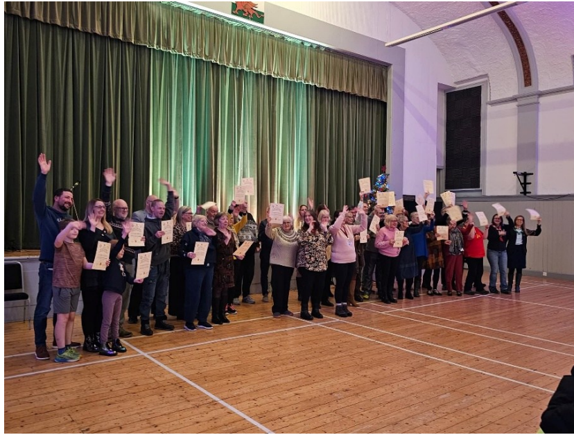
Volunteers presented with certificates during celebration evening December 2025

Mayor Nia Jones and the staff team organised an event to celebrate the work of volunteers in Llanfairfechan across the projects and events in town. Over 50 certificates were handed out, and 80 people attended to hear speeches, enjoy the mayor's buffet and observe the distribution of certificates.