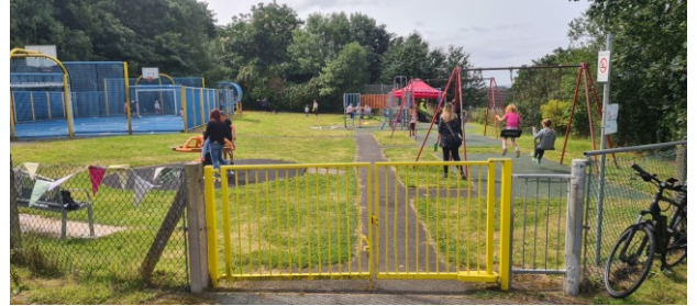
Setting up for Pendalar Community Day