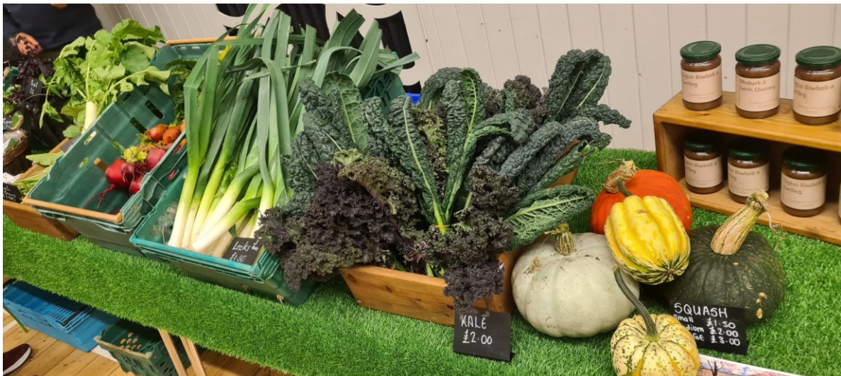
Stallholder Growing for Change at a Food and Artisan Market