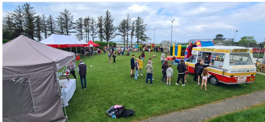
Llanfairfechan Celebrates 2026

Llanfairfechan Celebrates has been a regular event in annual calendar, and this year marked the reopening of the paddling pool after extensive work by Conwy CBC to install a pump room and update the site.