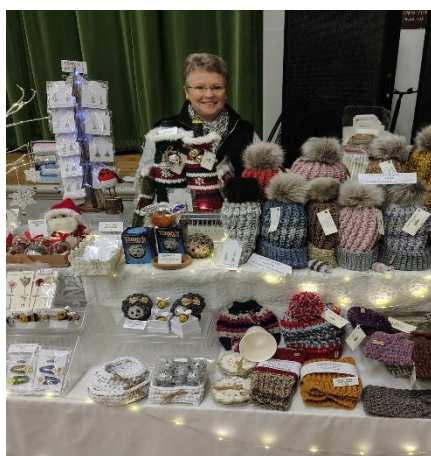
Stall Holder 'Off the Hook' at a Food and Artisan Market