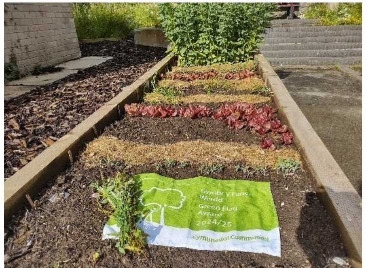
Victoria Gardens has won the Green Flag award in 2024/25 and 2025/26

Groups meet on a weekly basis during the summer months. There are two community garden sites: Station Road Garden and Victoria Gardens Incredible Edible plots. In addition, there is a vibrant Community Orchard group with the Llanfairfechan Fruit Trail in development. The groups help with the annual Big Green Week in Llanfairfechan and often hold soup and social evenings at the sites.