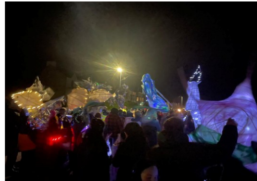
Lantern Parade & Fireworks night 2025