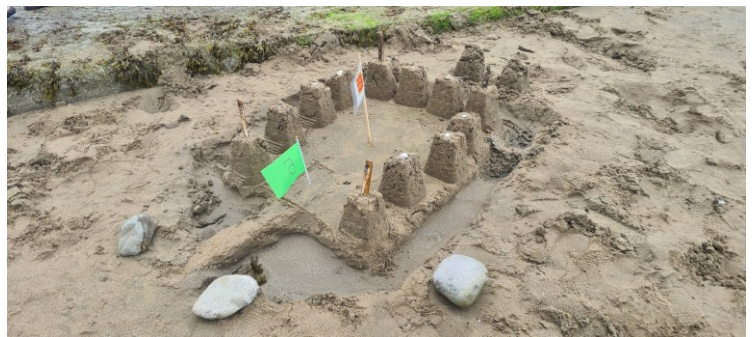
One of the sandcastles created during the sandcastle competition

The Mayor's civic event in 2025 was designed to be a family friendly activity and feedback was great. The weather was very kind, and many families joined in with the celebrations.