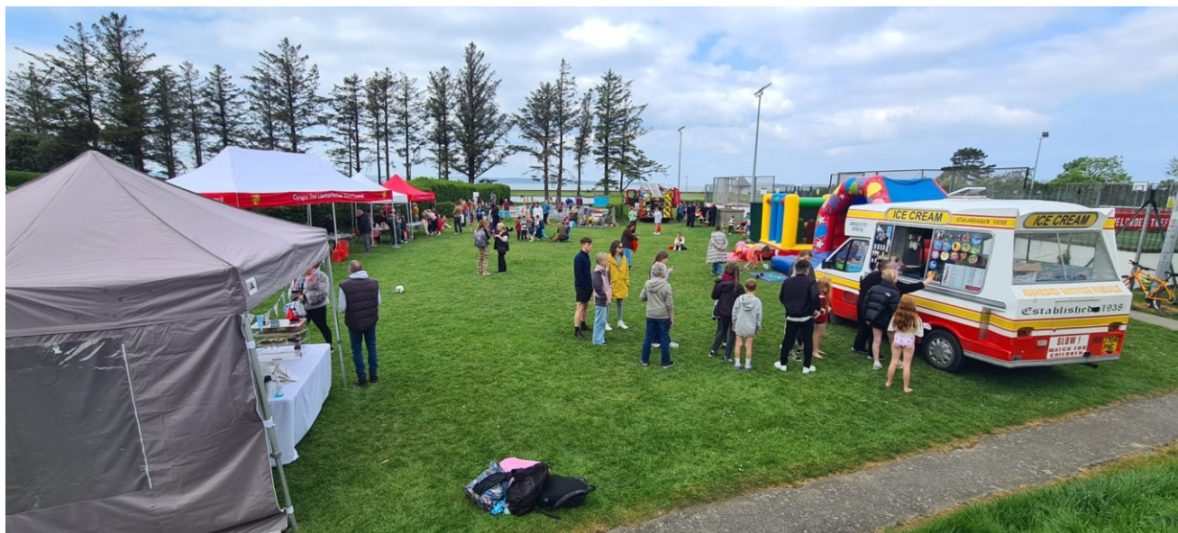
Llanfairfechan Celebrates 2026

Llanfairfechan is a corporate body, formed under the provisions of the Local Government Act 1972. It is an independent local authority and is part of the first tier of local government, with an important role in shaping and representing the local communities it represents.